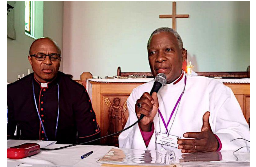
Photo: Bishop-Elect Cetywayo with Archbishop Thabo Makgoba at the Elective Assembly.